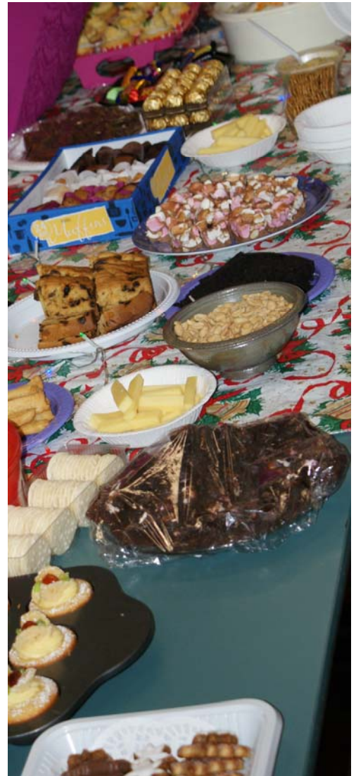
Just some of the great food for the last meeting